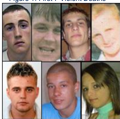
Figure 1: First 7 Violent Deaths

http://antidepaware.co.uk/bridgend-the-antidepressant-factor/